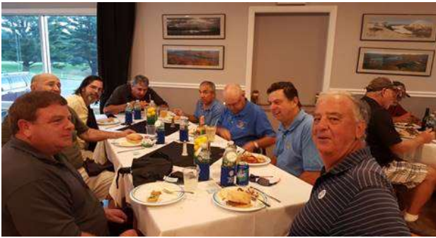
Council 10417 enjoys the buffet